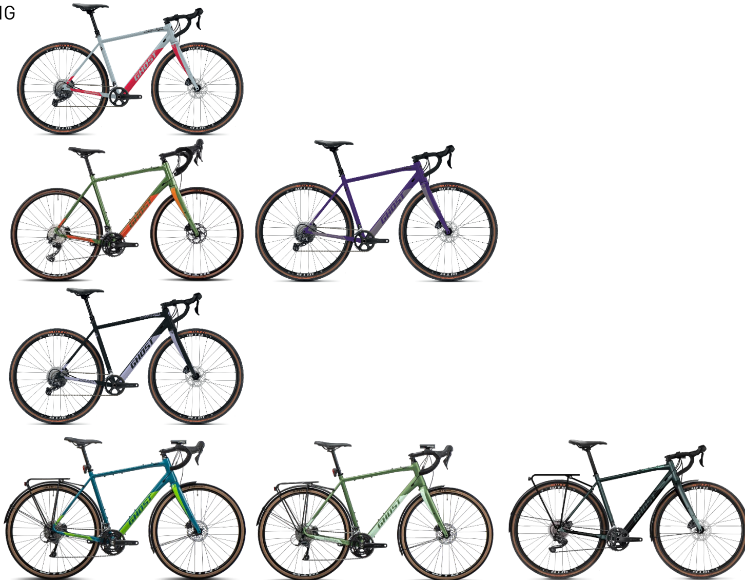
ROAD RAGE AL (MY22)